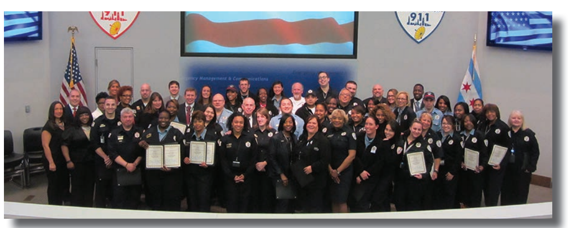
IBEW 21 members working at the City of Chicago 911- OEMC center received numerous awards for going above and beyond the call of duty.

Union workers will make a difference in all the national and local races in the November General Election. The next President could appoint up to three new continued on next page