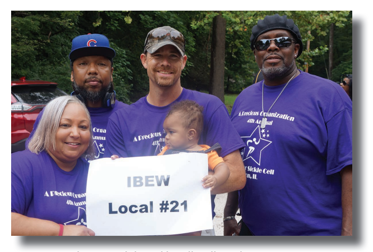
IBEW 21 members attend the Sickle Cell Walk in Alton, IL.

We took a long time to adjust to GPS enforcement when it was new. We left a lot of lost wages on the table before we stopped going to breakfast or running personal errands. We've reach the point with OP78 where we have to stop giving management the low hanging fruit of an unlocked cabinet or a half open window. We work hard for our money let's keep them out of our pockets.